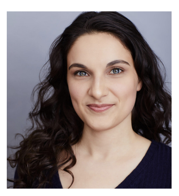
wonderful group of artists! IG: @shirasteiner